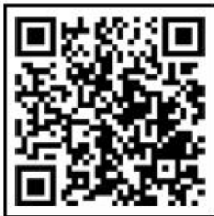
Book Fair Payment